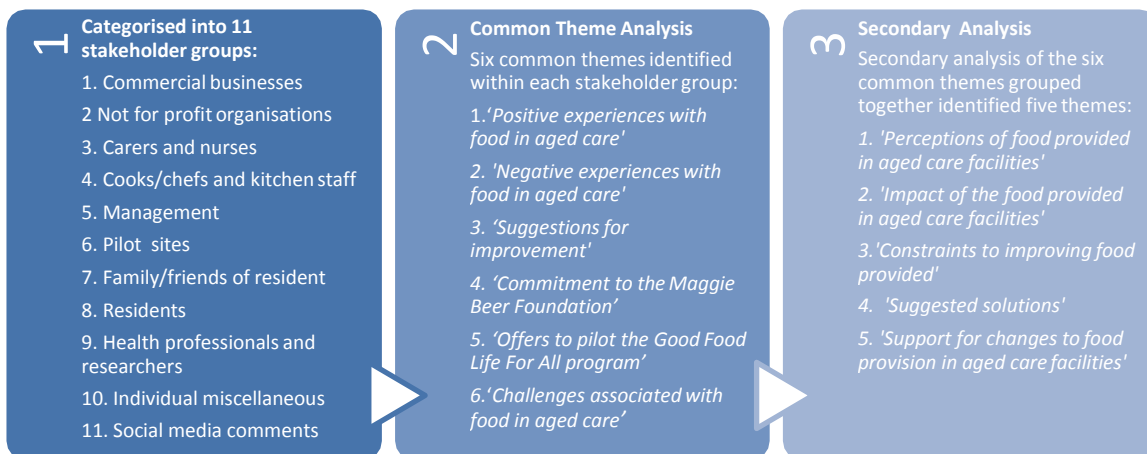
Figure 1: Thematic Analysis Process of 202 pieces of correspondence received between April-October 2014 regarding the MBF